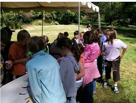
Students participating in last year's festival at Lewisville Park.

The Columbia River Watershed festival is sponsored by Clark County, City of Vancouver, Clark Public Utilities, US Fish & Wildlife Service and Columbia Springs.