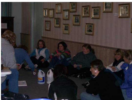
Project W.E.T participation