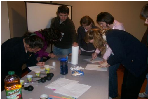
Beneficial Insects (June '08)

The program is much the same. The purpose is to provide quality environmental education workshops, materials and resources for teachers, assist with planning and development of community programs and in-class school presentations.