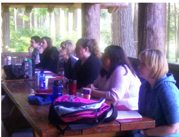
Teachers listen in at "Pacific NW Forest Regeneration at Lewisville Park"