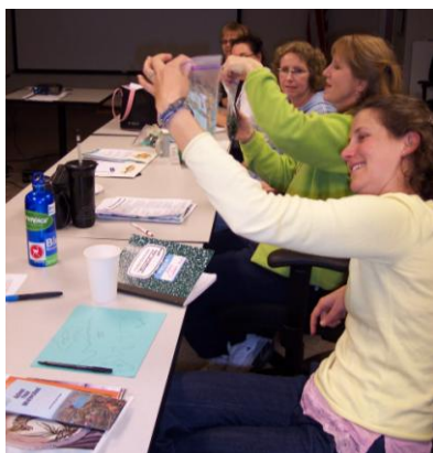
Toxics & Native Fish of the Columbia River