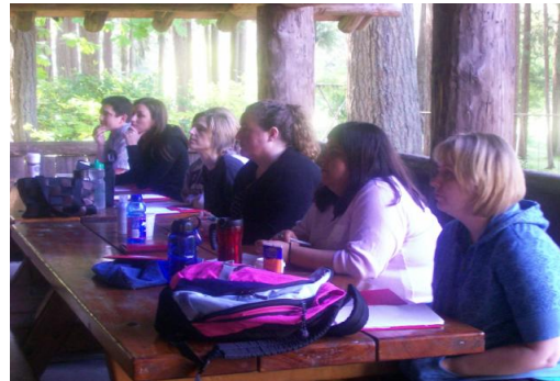
Pacific NW Forest Regeneration (May '08)