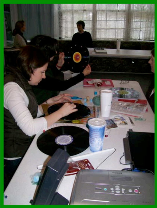
Making Clocks from reclaimed materials during the 4 R's workshop (Nov '08)

Nearly 130 teachers participated in nine teacher workshops since August. Below are some photos of the participants, are you in a photo or perhaps you recognize a colleague?